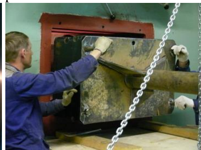
Installation of technological equipment of hot chambers