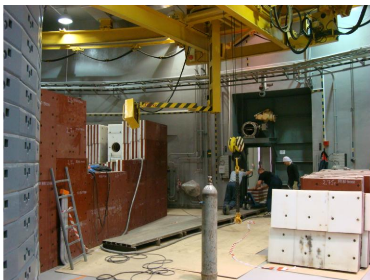
Installation of the neutron and biological protection