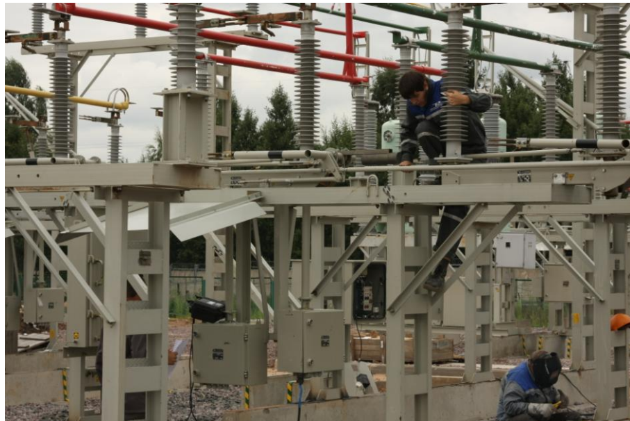
Building for special ventilation and electrical substation