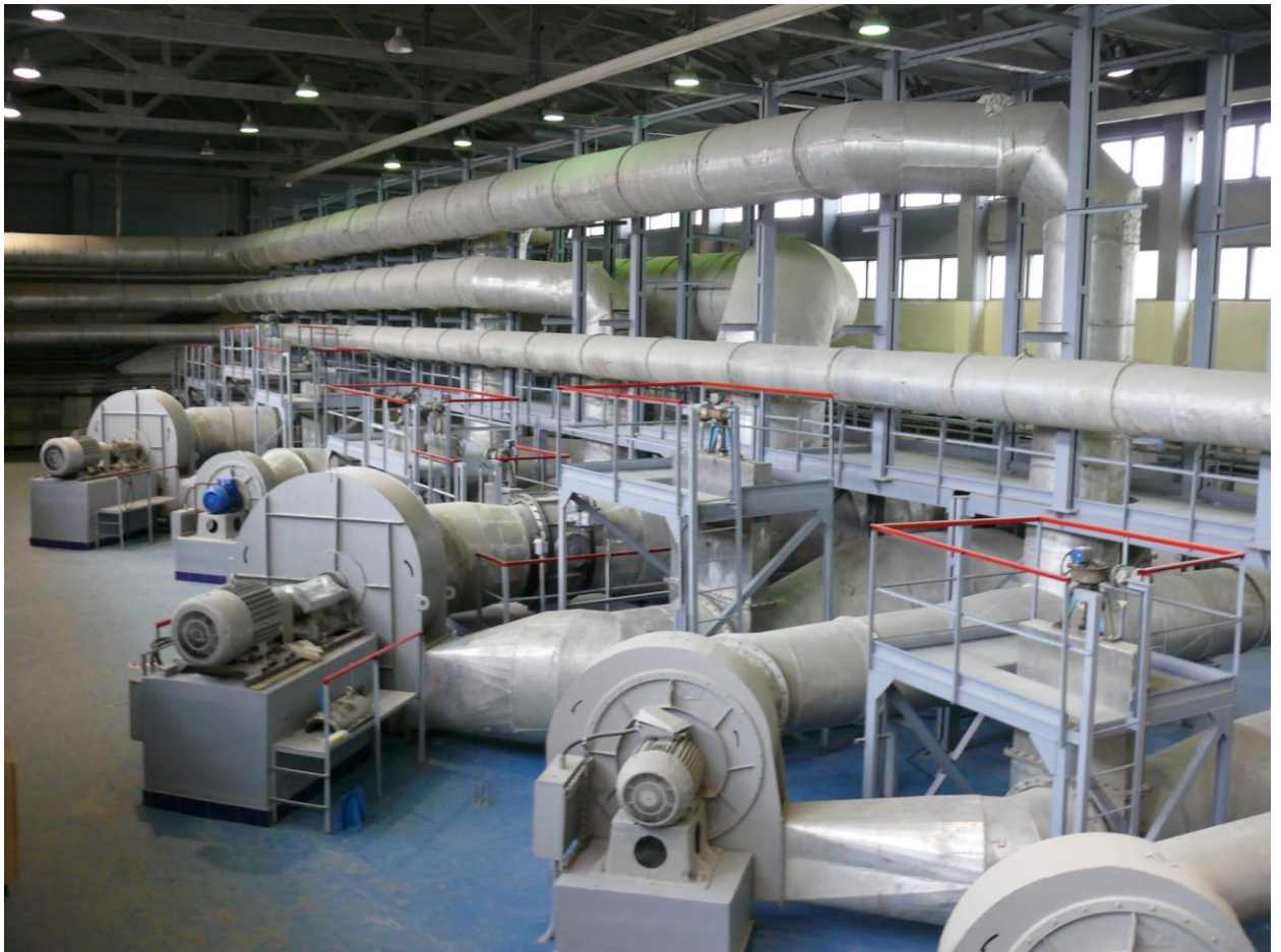
Center for special ventilation