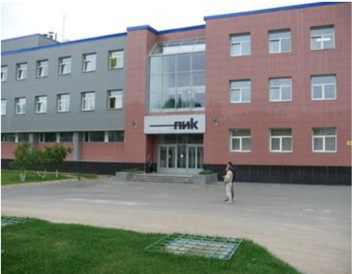
General view of reactor complex.